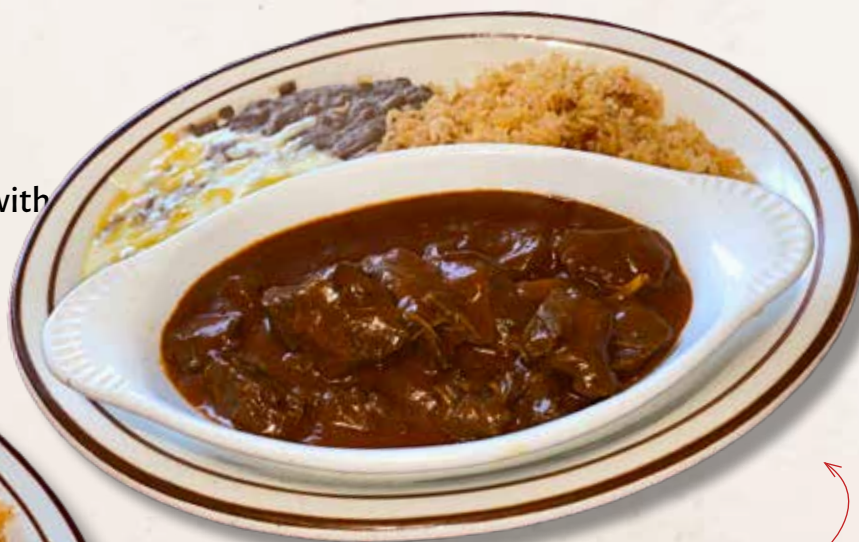
30. Chile Colorado