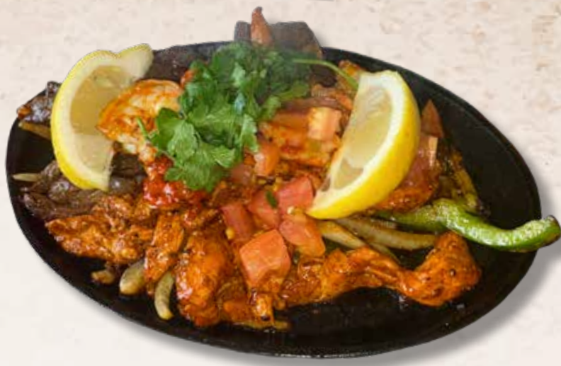
26. Fajitas Supremas