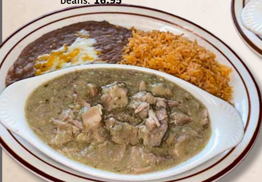
31. Chile Verde

Two chicken enchiladas topped with chile verde sauce and melted cheese. Served with rice, beans, guacamole and sour cream. 16.50