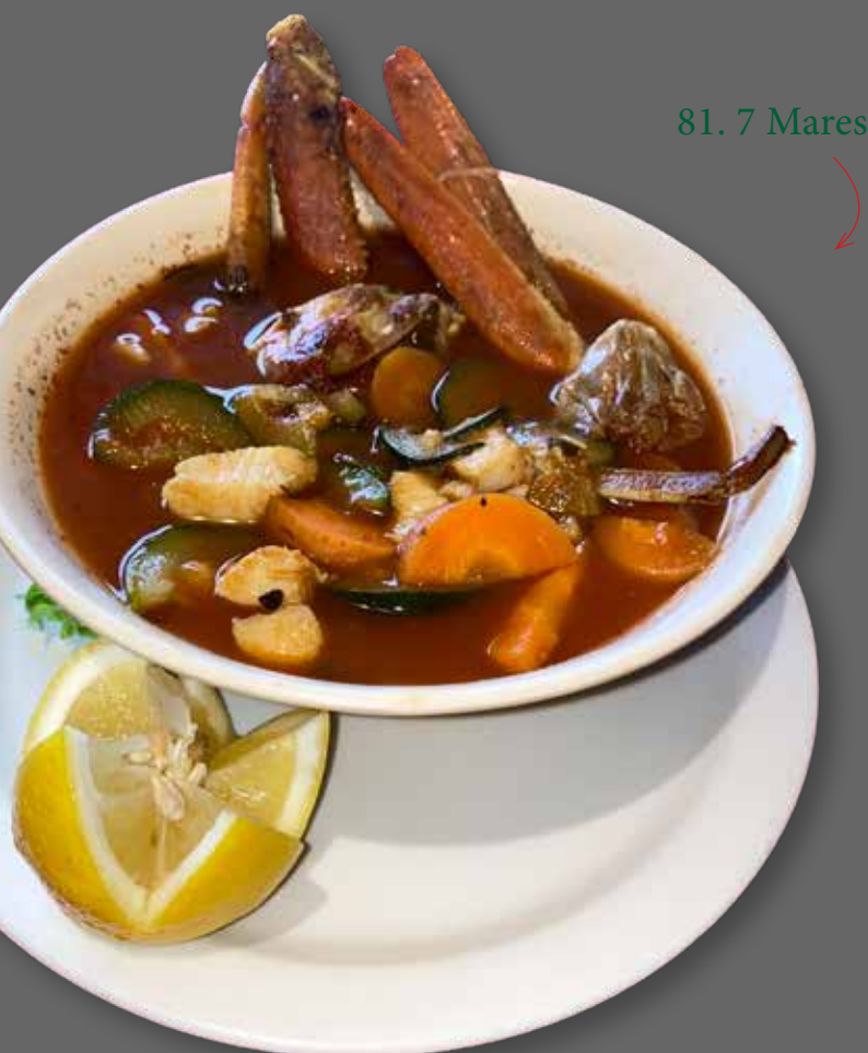
81. 7 Mares